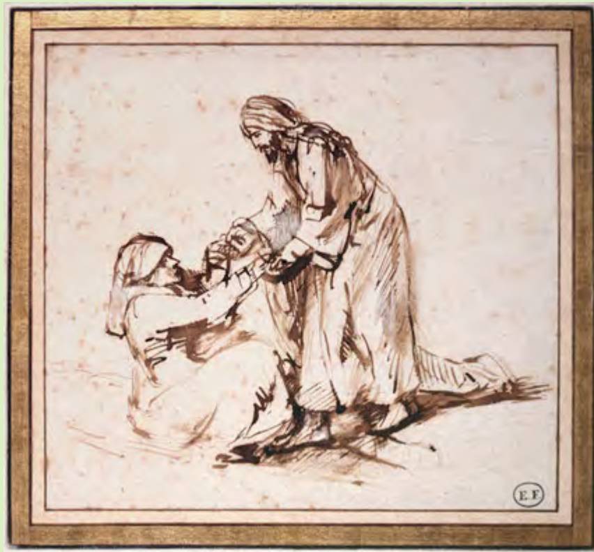
Healing of the Mother-in-Law of St. Peter by Rembrandt